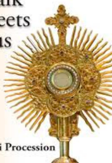
Corpus Christi Procession